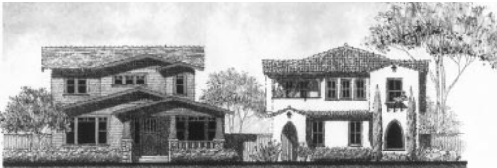
The combination of the side-by-side Craftsman and Spanish Colonial styles compliment the Historic French Park District of Santa Ana, where the Mercy House Garfield Street Project is located.

The Bassenian/Lagoni architectural team has joined the Mercy House Garfield Street Project and will work in collaboration with Bloodgood Sharp Buster Architects.