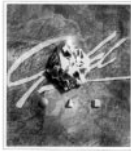
EMMANUEL HOUSE SHINES BRIGHTLY AT GOLD NUGGET AWARDS

A special thank you to OCAR for its continued support of HomeAid Orange County. A portion of the proceeds from their annual events will be gifted to HomeAid at the end of the year.