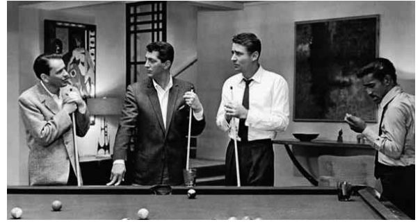
Ocean 11's Rat Pack sparked the theme of the 2005 Rainbow of Hope Ball.

This year's theme, "Ocean's 11" is fashioned after the Sinatra-led "Rat Pack" shenanigans of the early sixties. So come strut your stuff and bring your gamblin' coin ready to lose a bundle, all in good fun to benefit the thousands of homeless we serve.