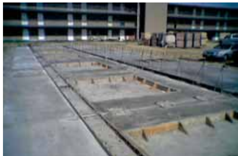
When completed, The Village of Hope will provide 192 beds to homeless families.