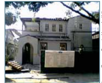
Lennar Orange County Homebuilding Bassenian/Lagomi Architects

Homeless numbers are rising at an astounding rate – from 11,000 in 1999 to 35,000 in 2004, more than triple in just five years! The face of homelessness is changing. No longer is the ‘man with the shopping cart’ the homeless majority, in today’s world families and children represent 65% of the homeless population!