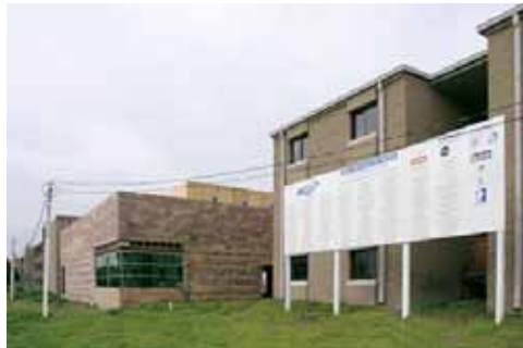
Village of Hope sign including building