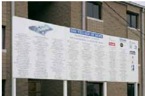
Hundreds of contributors have generously donated to The Village of Hope.