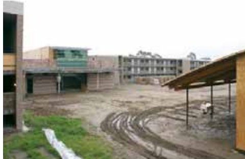
Village of Hope chapel view from barracks

As of this writing, shells of the chapel, auditorium, warehouse, administration and cafeteria are nearly complete. Major headway has also been made on the medical wing, which is also nearing completion.