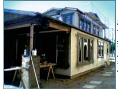
Lennar South Coast Homebuilding Bloodgood Sharp Buster Architects