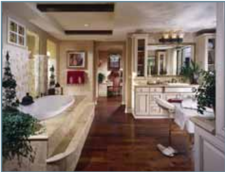
Altamura, William Lyon Homes